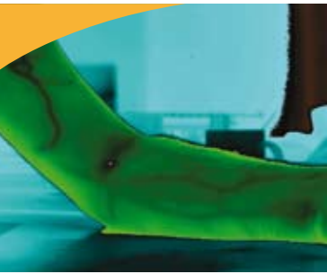
Medical application: veins