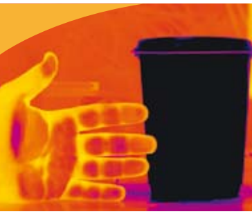
Thermal imaging: cold cup